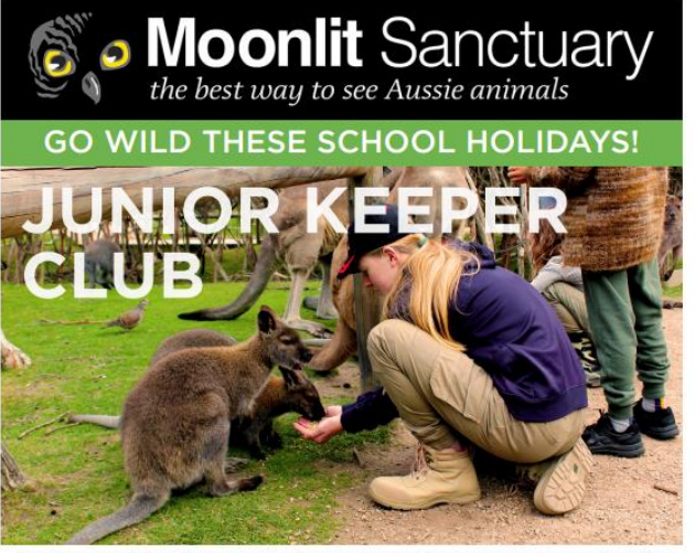
ENVIRONMENTAL ACTIVITIES, ANIMAL ENCOUNTERS AND NATIVE ANIMAL CARE

activities. Learn about our animals, their conservation and the environment For ages 7-14 years.