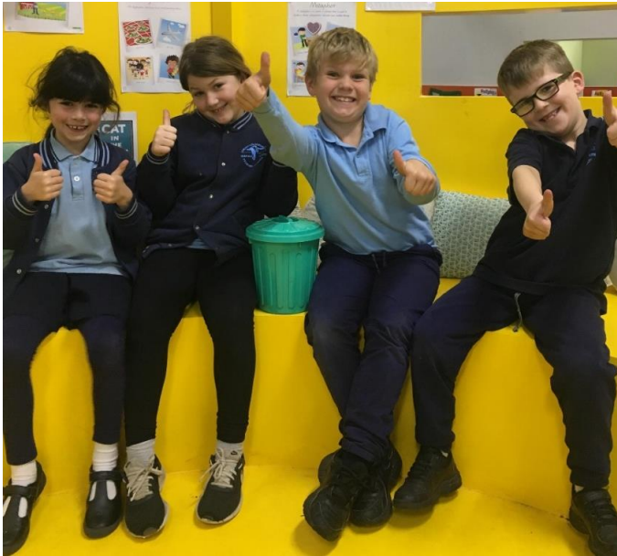
Meet the new 2H bin!

Our Central Idea 'Earth's resources are important to us and we use them in a variety of ways' has made us consider how resources are used and disposed of, as a result we are changing the way we think about waste!