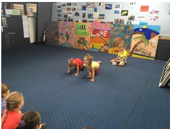
FS performing using elements of dance, drama and music!