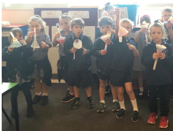
FS singing with puppets