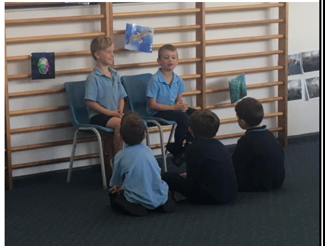
1PB a group performing their scene to the class