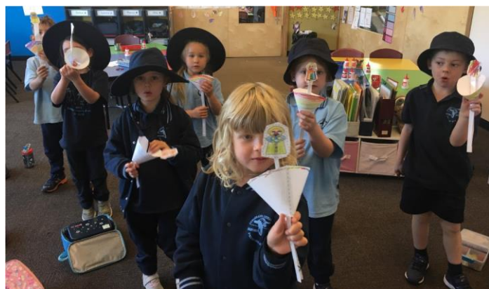
Great job singing high and low FT!