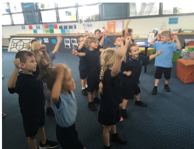
FG practising movements for a lion dance