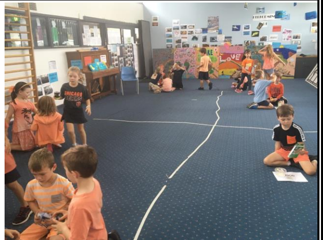
1PB Music Exploration What is making that sound, how, why?