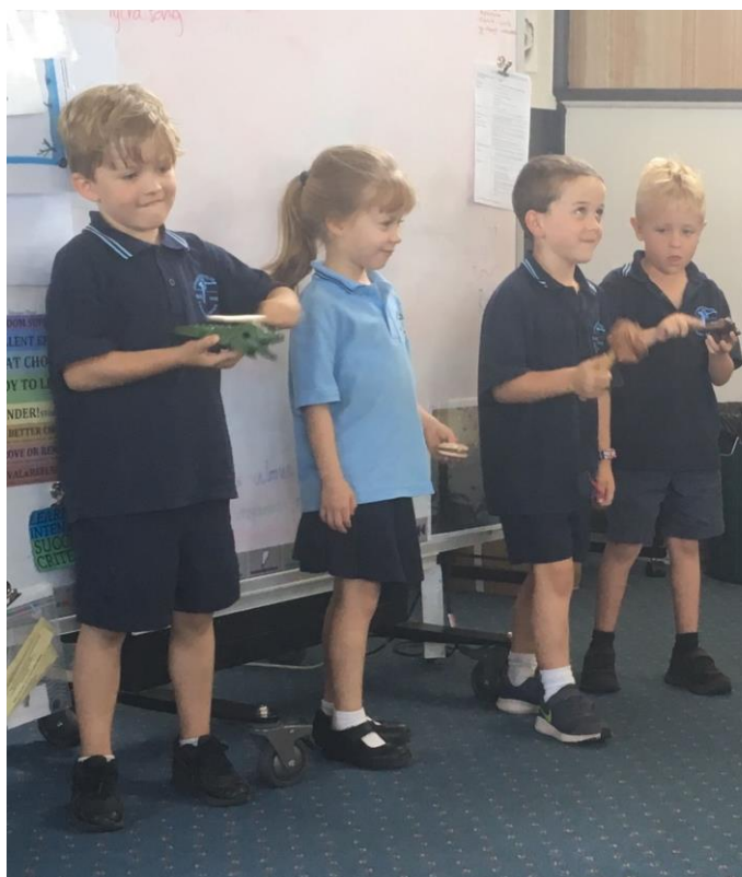
1R using percussion instruments to make and perform music in a group