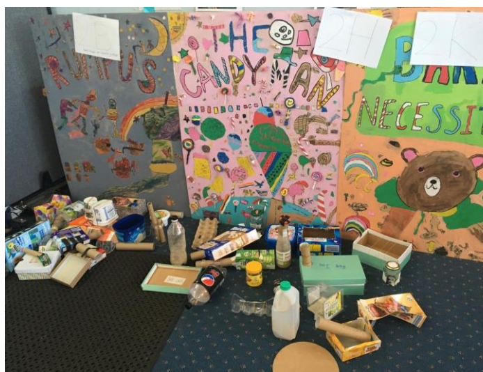
2H and 2B's progress on their instruments