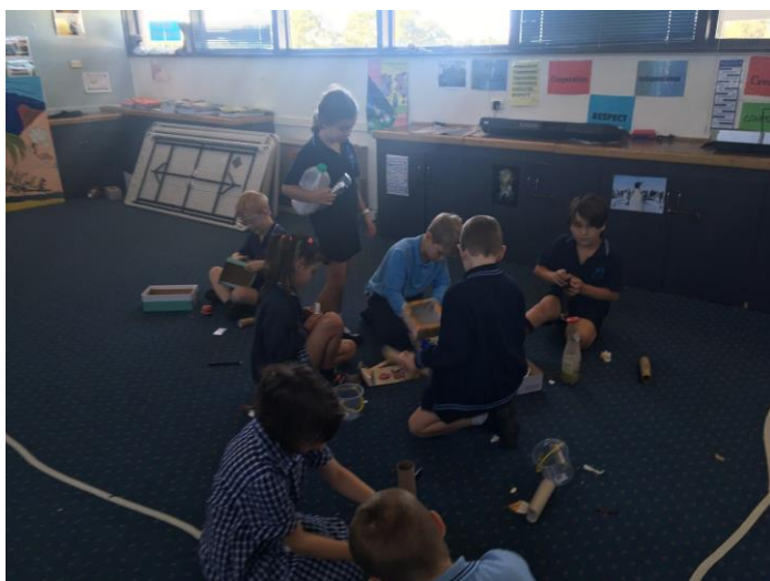
2H making their instruments from recycled materials