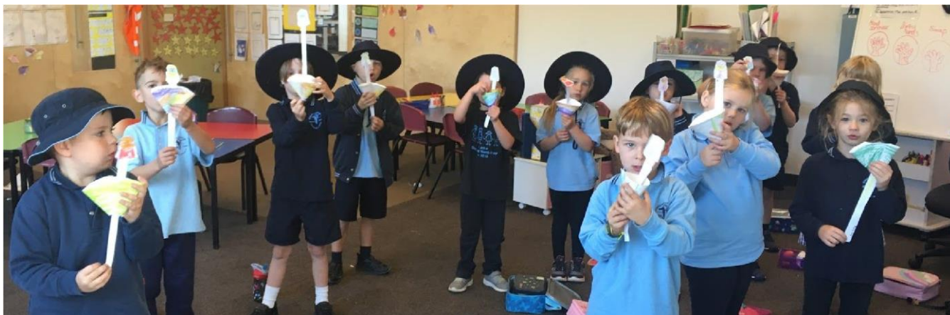
FT playing with their 'Fun with Fuzzy' puppet they made. Using their puppets to make connections with movement and pitch when singing.