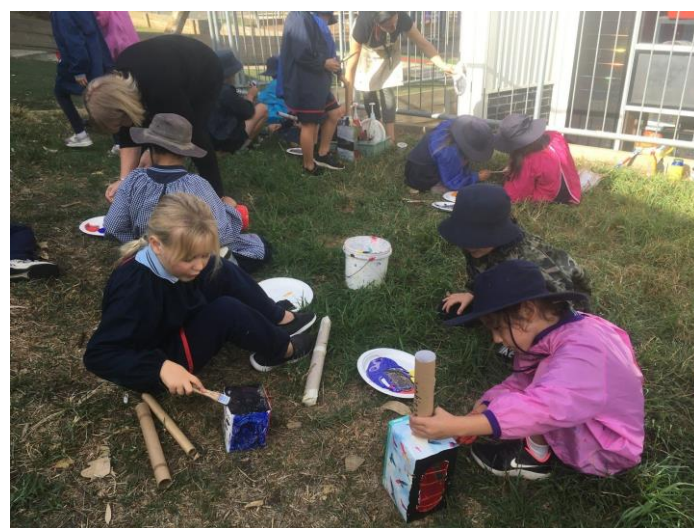
Week 1 Term 2 - 2K painting their instruments outside in Visual Art