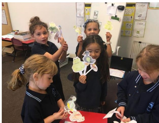
These students in FM made their own puppets and were excited to share their creations