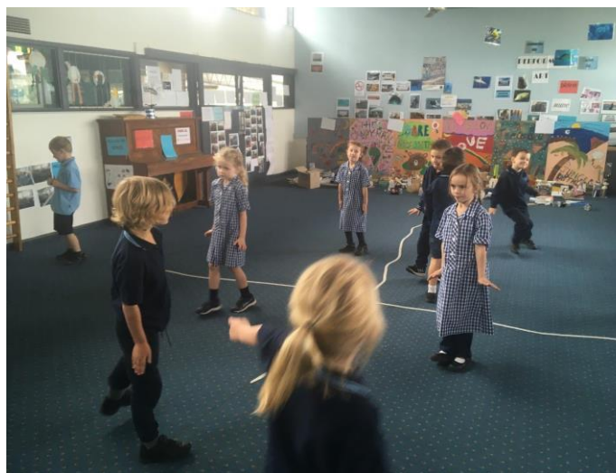
Students in FG playing a movement game, moving like sea creatures