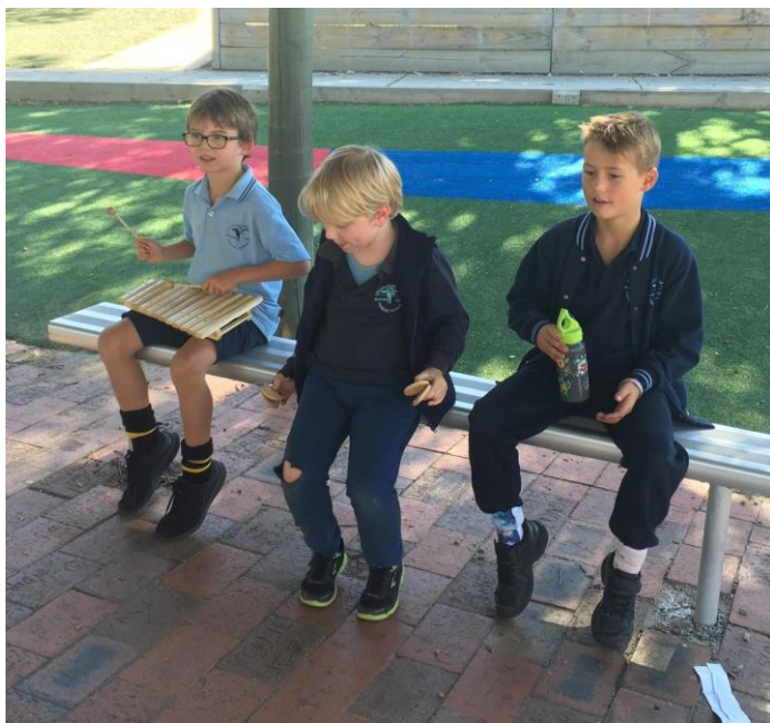
Students performing music they created through improvisation outdoors, using percussion instruments and objects in their music.