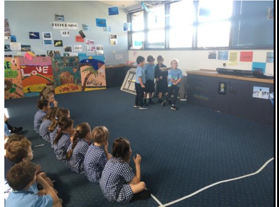
1W students performing to an audience of their peers