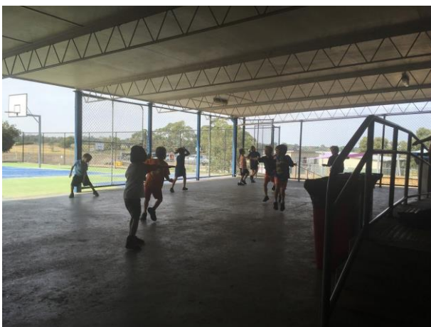
1T dancing and listening to different genres of music for Harmony Day