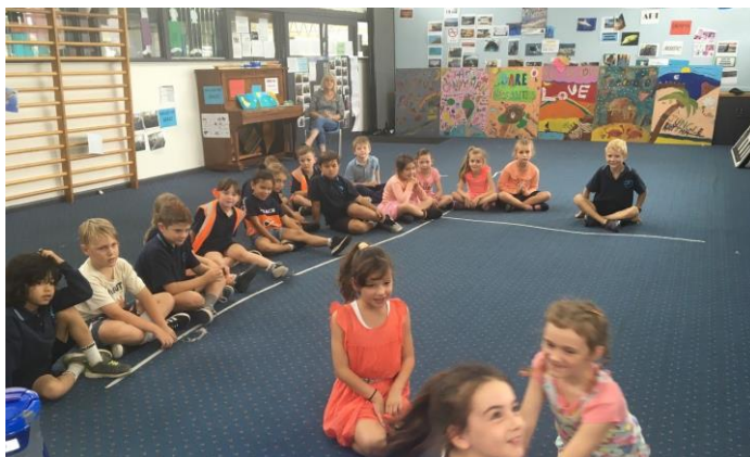
Students in Grade 2 performing to the class