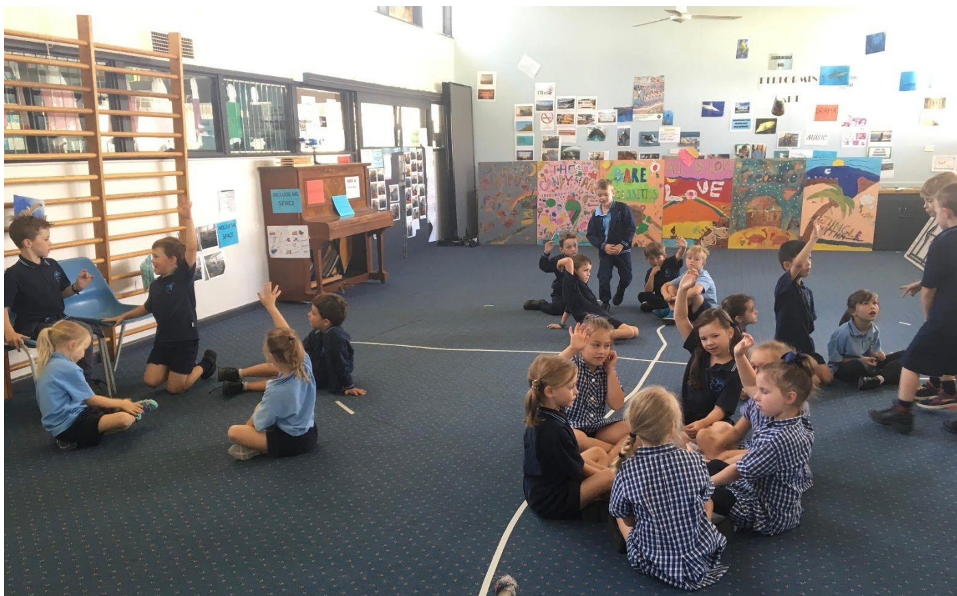
Student in groups voting on who could play the different parts of a given scenario. They displayed cooperation, enthusiasm and confidence when rehearsing and performing.

Grade 1 students have been doing drama in Term 1 linking into the classroom Central Idea 'Emotions may influence our behaviour'.