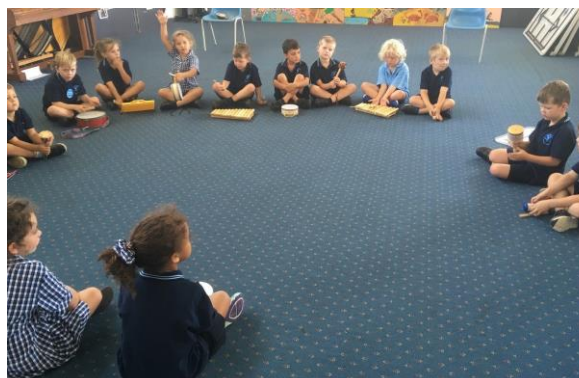
FM music exploration