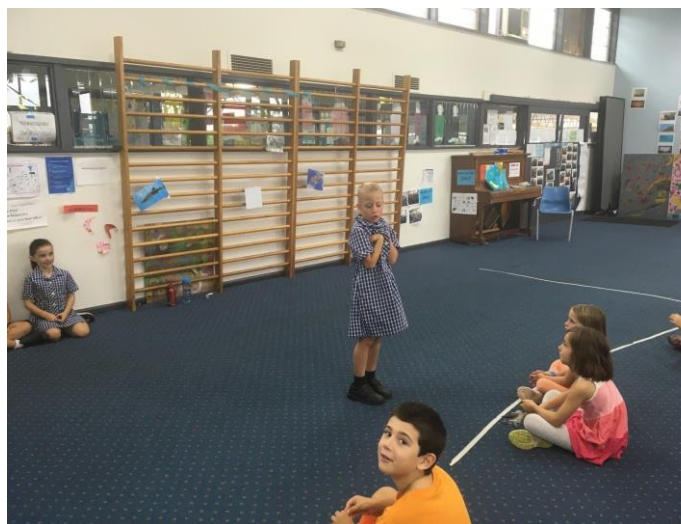
Students performing their improvisations to an audience of their peers

Grade 1 students have been doing drama in Term 1 linking into the classroom Central Idea 'Emotions may influence our behaviour'.