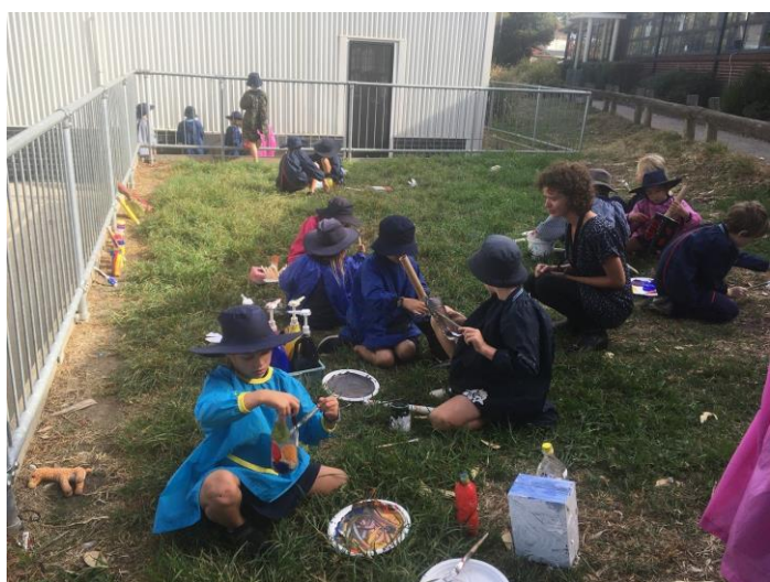
Week 1 Term 2 - students painting their instruments outside in Visual Art