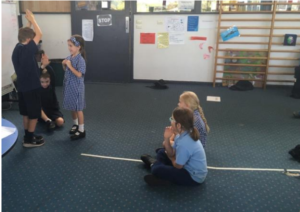
1T students performing their emotions scene to the class