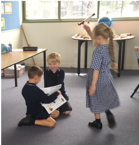
1R performance on expressing emotions