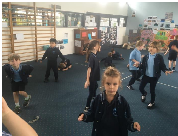
FT students moving like animals from the sea