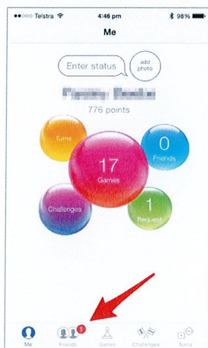
Friend Request Alert

https://www.esafety.gov.au/esafety-information/games-apps-and-social-networking