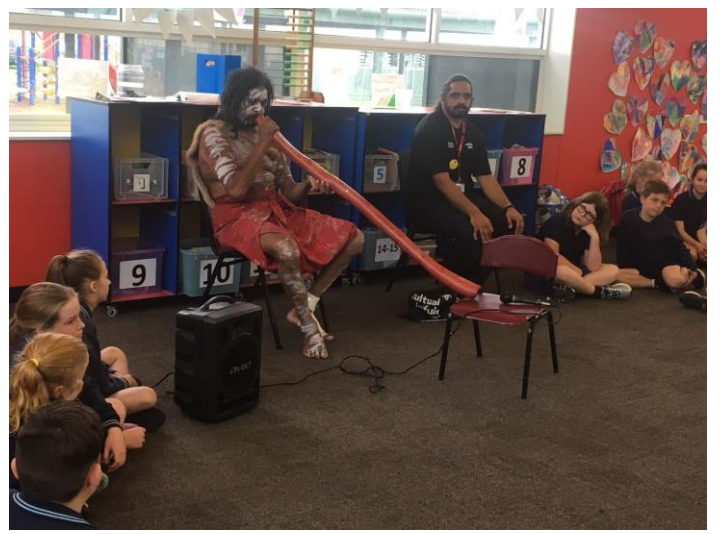
Grades 3 6 enjoying a performance by Cultural Infusion, titled “Indigenous infusion with western creation”